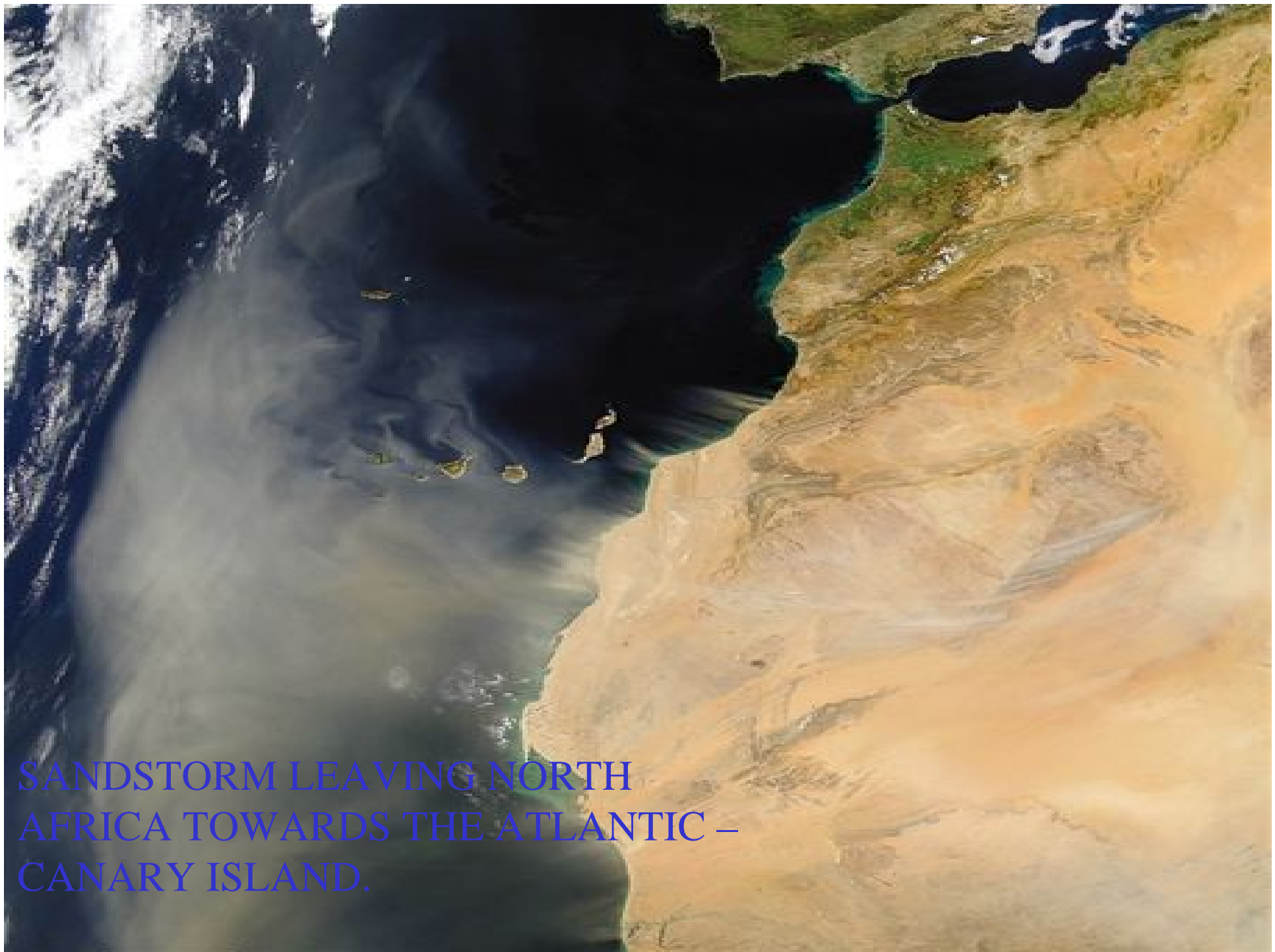
SANDSTORM LEAVING NORTH AFRICA TOWARDS THE ATLANTIC – CANARY ISLAND.